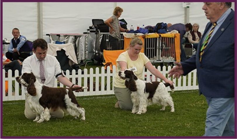
CHALLENGE FOR BOB