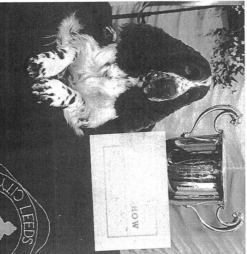
Sh Ch WADESON INSPECTOR WEXFORD after BIS at Leeds