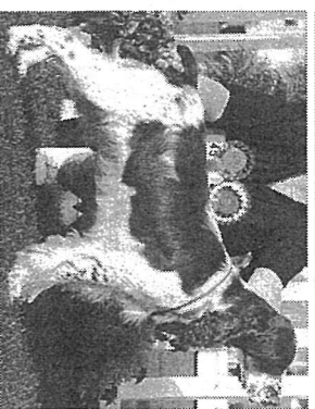
Ch Mompasson Remember Me.

1 The answer is hard to come by as there have been many very good English Springers over the last 45 years and I could name a dozen outstanding ones. However, Ch Mompasson Remember Me must be one of the best for her wonderful quality, beautiful head and eye and all-round abilities.