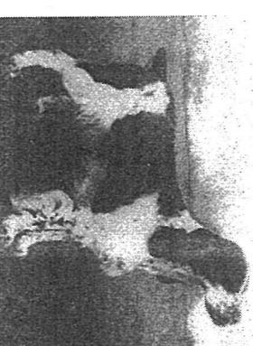
Sh Ch Shayleigh Paulina.

2 Breed type has changed considerably, heads lack correct stop and chiselling in skull. Ears are too low set and eye rims often slack. Bone is often too coarse especially in the hocks. Tailset is often too high and so lacks the lively action while the short dock makes it impossible for the tail to be used as an indicator when at work.