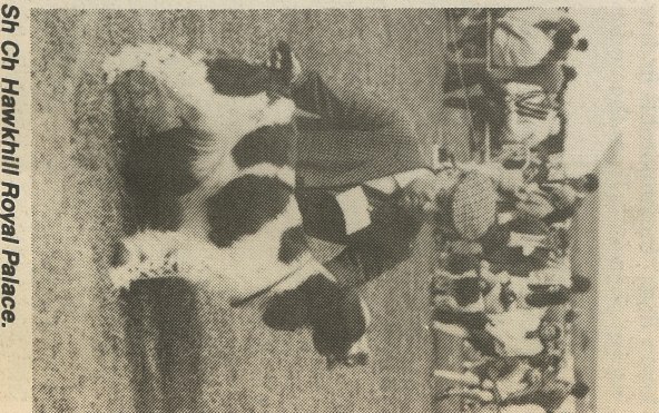
Sh Ch Hawkhill Royal Palace.