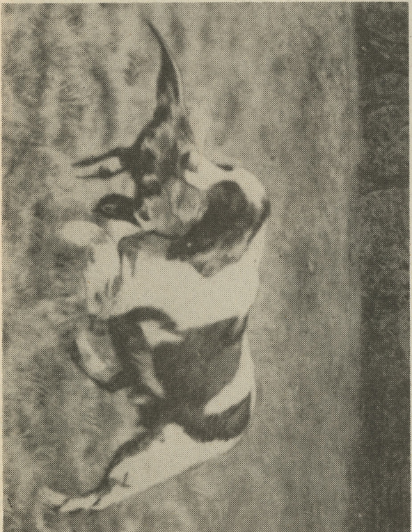
Ch Beechgrove Donaldson.