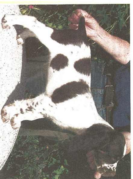
'Oliver' aged 9 weeks unbroken line