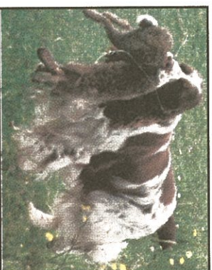
Truly dual-purpose - Ch Mompesson Remember Me, the bitch CC record holder in English Springers, combines beauty and brain