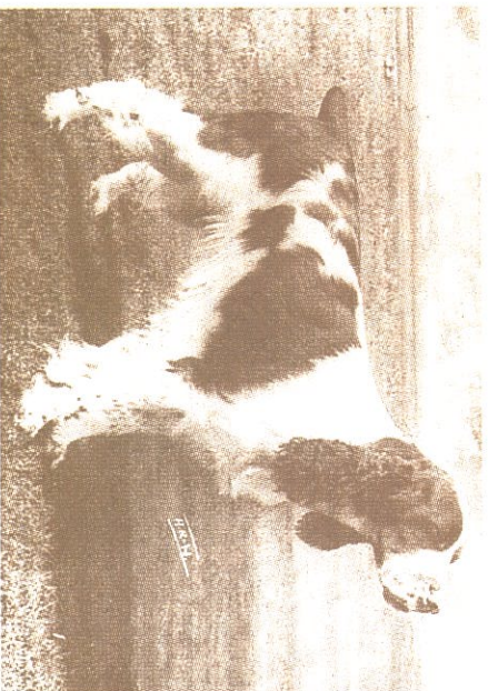
The breeders' choice: Sh Ch Hawkhill Connaught, Top Dog 1973, the first year of the DOG WORLD competition

NEW BREED RECORD HOLDER • NEW BREED RECORD HOLDER • NEW BREED RECORD HOLDER • NEW BREED RECORD HOLDER