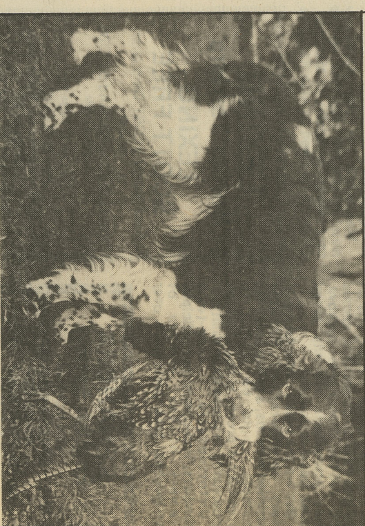
Ch Teesview Titus at 12 years old, exhibiting the dual-purpose role of the Teesview dogs.