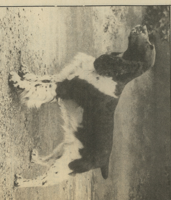
Sh Ch Teesview Pandora of Truelindale, the CC record-holding bitch.