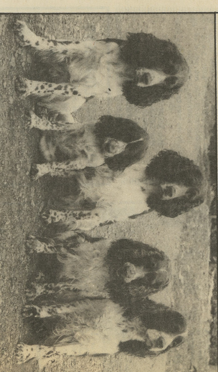
A Teesview group — left to right, Timber, Talk of the Town, Tarmac, Tarama and Titus.